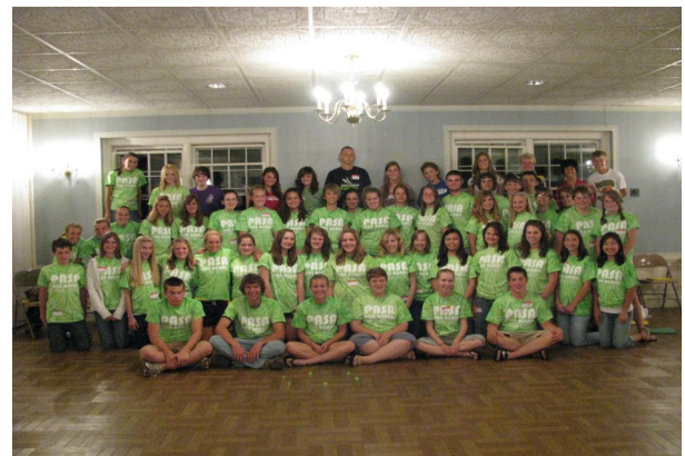
2008-2009 PASA Teen Board